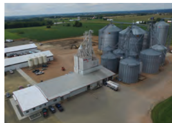
MARATHON FEED & GRAIN 715-443-2424