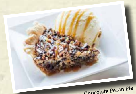
Chocolate Pecan Pie

With one scoop of vanilla ice cream - topped with a caramel cream sauce.