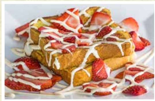
Stuffed French Toast with Strawberries