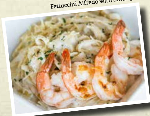
Fettuccini Alfredo with Shrimp