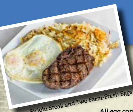
Sirloin Steak and Two Farm-Fresh Eggs