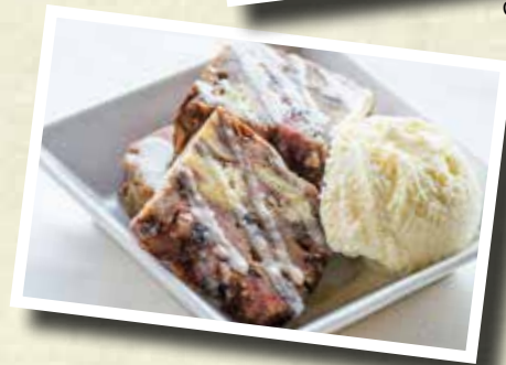
Warm Bread Pudding