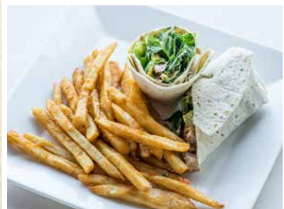
Crispy Chicken Wrap

Fried chicken tenders, chopped romaine lettuce, tomatoes, shredded cheddar cheese and ranch sauce.