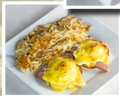
Classic Eggs Benedict

Julian Eggs Benedict ..... 9.49 Two toasted English muffins topped with tomatoes, spinach, mushrooms, two poached eggs, and hollandaise sauce.