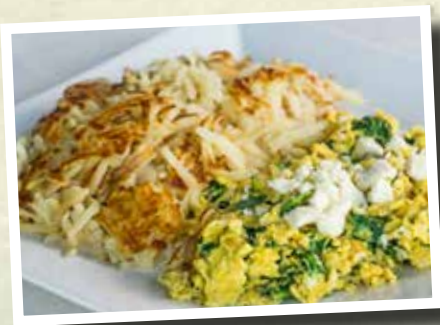
Spinach and Feta Cheese Scrambler

Ham Scrambler ..... 8.49 Ham with shredded cheddar cheese.